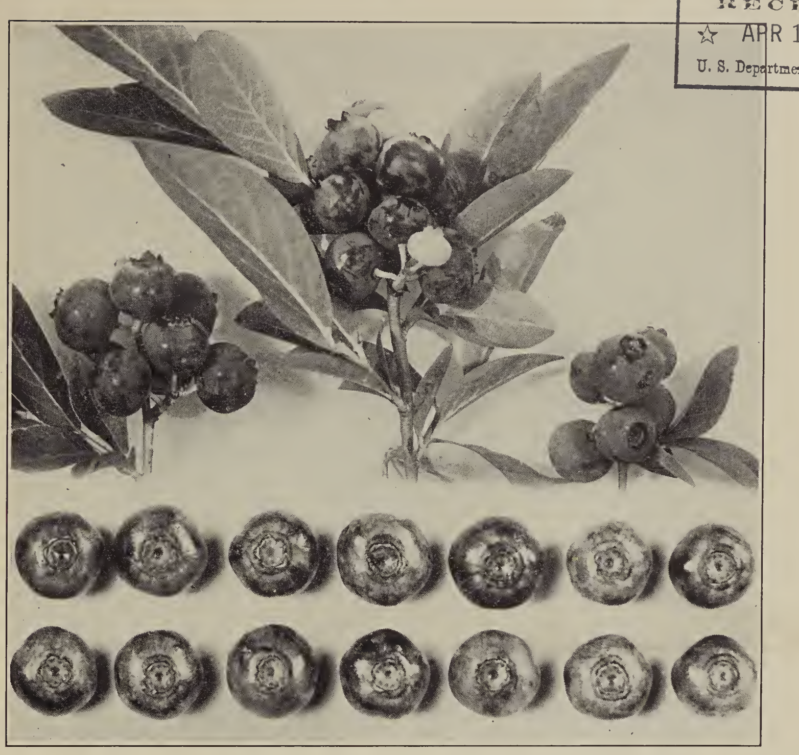
Cultivated Blueberries - Actual Size